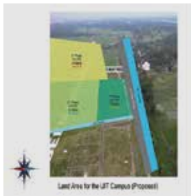
Land Area for the UIT Campus

21 Kilometer From Hazrat Shahjalal International Airport Dhaka