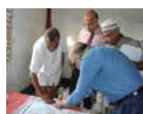
Discussion on the Project Layout Plan