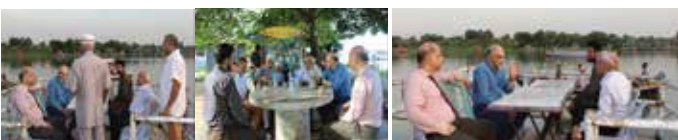
Discussion on the Architecture Design and Master Plan