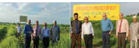
Site seeing for Landscape Design