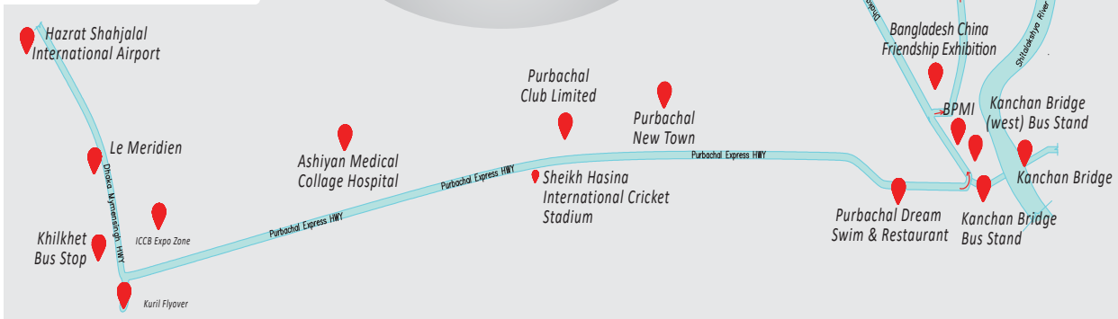
UIT campus location indicators

21 Kilometer From Hazrat Shahjalal International Airport Dhaka