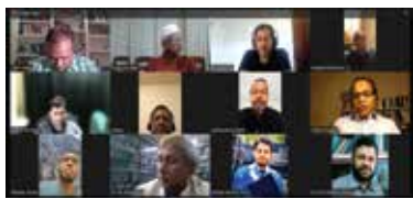
Discussion on UIT project with IUM Graduates (USA, Canada & Australia)