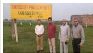
Dr. ANM Ehsanul Hoque Milon former State Minister of Education in Bangladesh visits at IUT Campus in March 2023