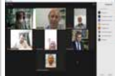
Fund raising meeting with UK group in August 2023