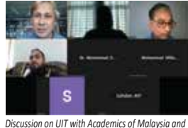
Discussion on UIT with Academics of Malaysia and Middleeast in December 2022